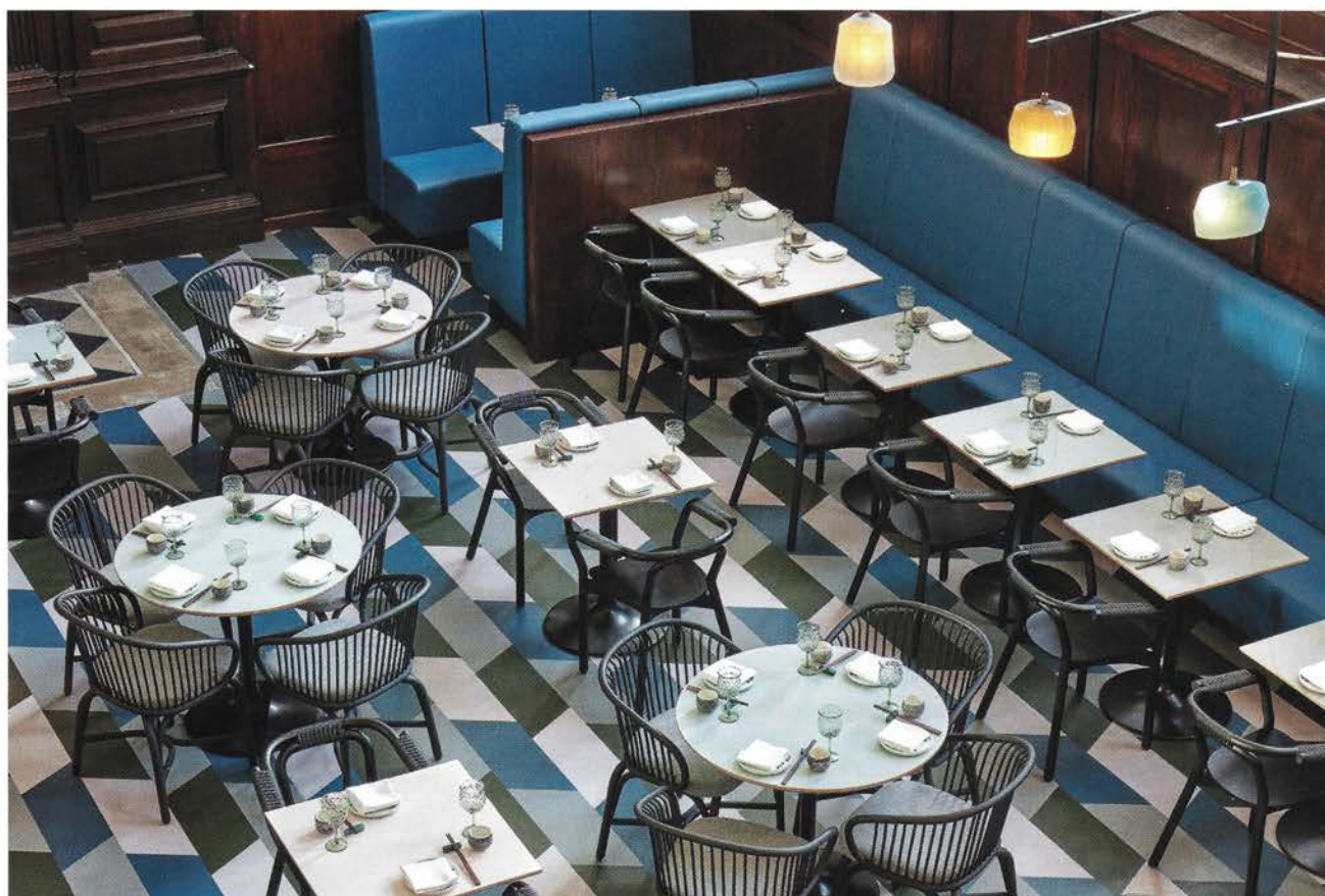
DUDELL'S RESTAURANT SERVES UP A RELIGIOUS CONVERSION IN LONDON, PAGE 091